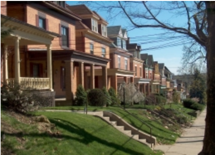
Homeowners have no preservation protection in Friendship.

3. Neighborhoods with the most unprotected sites include Downtown and the Hill District.