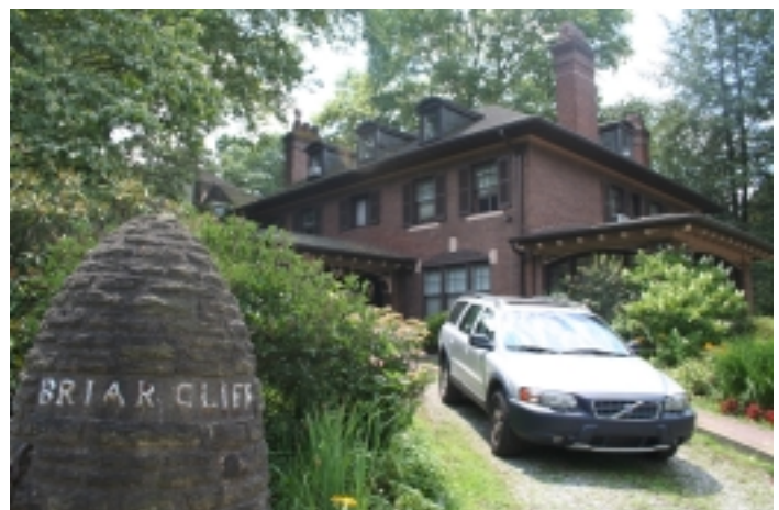
Briar Cliff Road in Point Breeze is a recommended historic district.