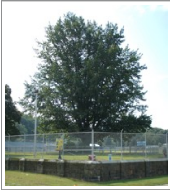
John Woodruff Oak Tree, Connellsville

1. Ernie Davis Birthplace (December 14, 1939 – May 18, 1963) (2, 5) Main Street at Mill Street New Salem, PA 15468 Football Player Ernie Davis became the first African American to win the Heisman Trophy in 1961. Born in New Salem, he spent part of his boyhood years in Uniontown, where he lived with his grandparents until relocating to Elmira, New York, to live with his mother and stepfather. Davis was the number one pick by the Cleveland Browns for the 1962 National Football League draft. He was diagnosed with acute monotypic leukemia on July 30, 1962. He died on May 18, 1963, and was mourned by the nation. Though Ernie never played a game for the Browns, they retired his number 45, which he wore only in practice. Both houses of U.S. Congress eulogized Davis. In Elmira, more than 10,000 citizens passed the house where he lay in state.