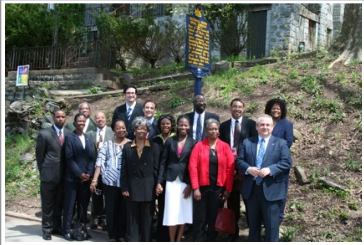
Dedication of the National Negro Opera Company historical marker, May 2007.