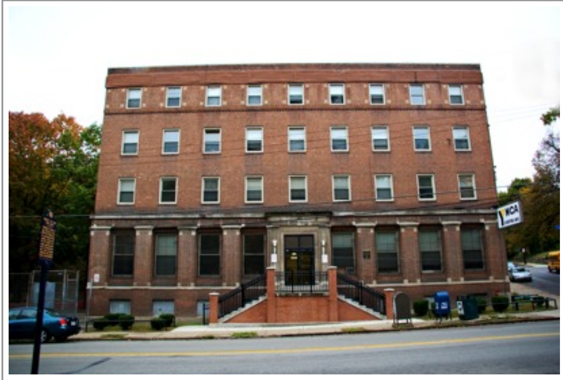
Centre Avenue YMCA