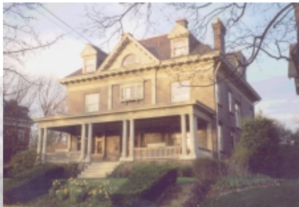
Cather's house at 1180 Murray Hill