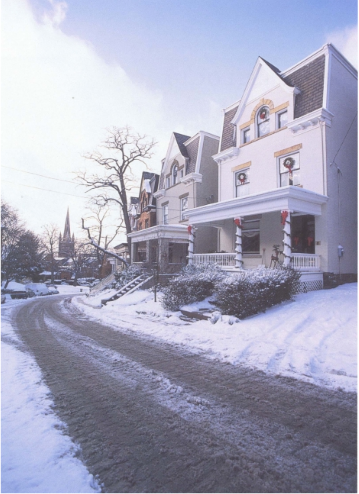
Photo from Pittsburgh's Landmark Architecture: the Historic Buildings of Pittsburgh and Allegheny County , by Walter Kidney, Pittsburgh History & Landmarks Foundation, 1997, p. 196. Photo by Jim Judkis.