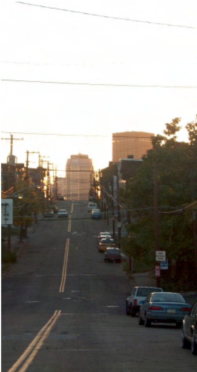
Preservation provides hope for the Hill.

Teaching local history in schools is an essential part of promoting the preservation of a variety of historic resources for the next generation. Pittsburgh and its surrounding counties have histories that are as diverse as they are complex, and saving those historical assets involves making educated choices that enter into the complexity of preservation.