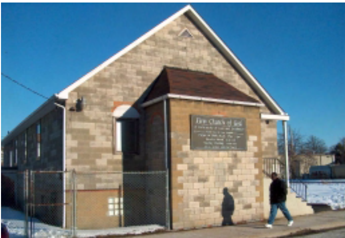
Can historic preservation save New Kensington?