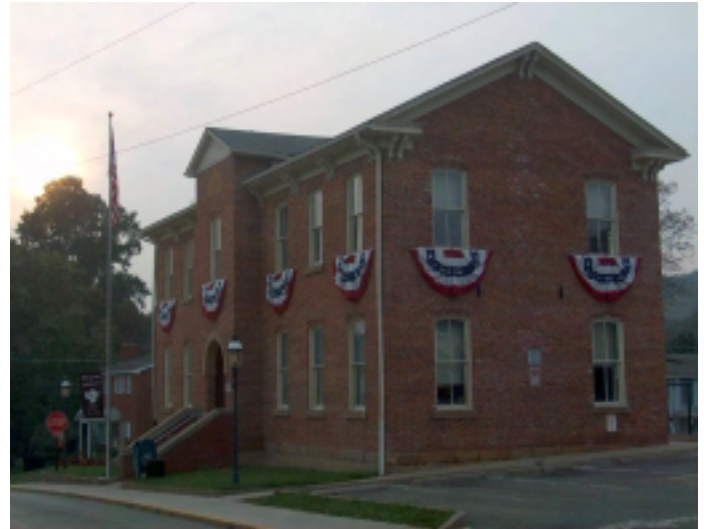
Enhanced signage would lure more visitors to sites like this in Harmony.