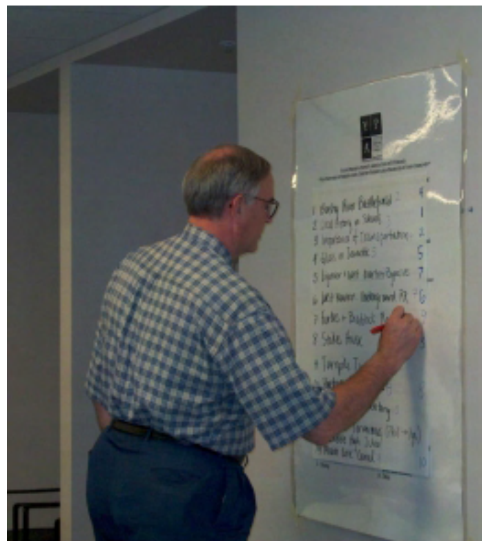
Voting on Westmoreland County's preservation priorities, June 21.

Solution: A solution to this problem would involve training educators in local history in conjunction with local branches of the NEA. With the current high interest in the French and Indian War in the Pittsburgh Region, educators could attend seminars on the war's local impact, which they could then take back to their classrooms.