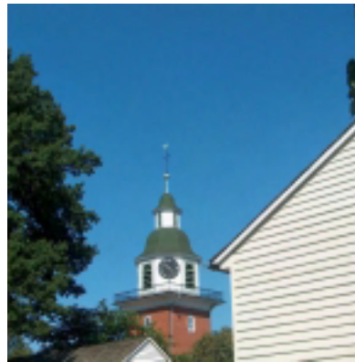
Old Economy National Historic Landmark District remains a major priority for Beaver County.