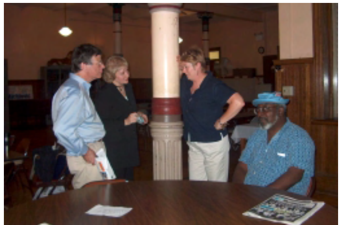
Participants at the Allegheny County Workshop, held Sept. 20.

The Steel Industry Heritage Corporation is the lead organization on this project. They have years of experience in dealing with these partners. The YPA could help facilitate a meeting among them and help raise this issue as a major preservation priority in Allegheny County.