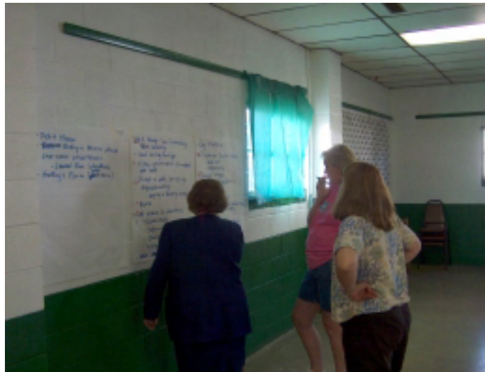
Workshop participants decide Greene County's preservation priorities.

Workshop participants also discussed marketing the economic benefits of preservation by using Waynesburg as an example. The Main Street program in Waynesburg continually attracts businesses to its historic business district. Participants found that the city could advertise its Main Street at nearby Waynesburg College as a place for college students to shop. With the preservation plan in place for the Greene County Museum and advertising of Waynesburg's main street retail, museum patrons could create an upsurge in business activity. Restaurants and entertainment could continually develop as activities to do after visiting the museum, making Waynesburg a vibrant area for consumers, competing with nearby commercial sprawl.