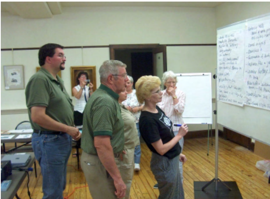
New Frontiers participants select preservation priorities in Indiana County.

It is the YPA's hope that the local hosts and actors identified in the action plans can remain to execute the plan. YPA stands ready to assist in the execution of these plans.