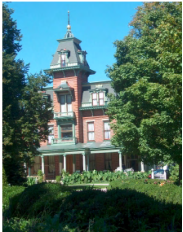
Pittsburgh's Highland Park neighborhood is healthy.