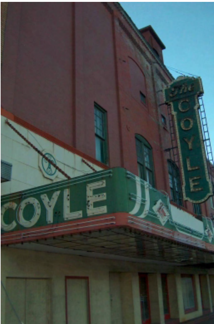
The Coyle Theater in Charleroi possesses preservation potential.

Solution: The top consensus among workshop participants is to form a county-wide cooperative partnership for heritage tourism, focusing on one particular issue at a time. Some leadership is now forming at the county level in the tourism department, and Washington County's comprehensive plan is receiving a tourism plan as well. Cooperation among historical societies is also necessary. This new county cooperative should identify one site or issue that can pull together the county. The Whiskey Rebellion could become an historic issue that could potentially pull together the county, especially because of its relation to national history. Other possible items of focus could be covered bridges or the Washington Wild Things.