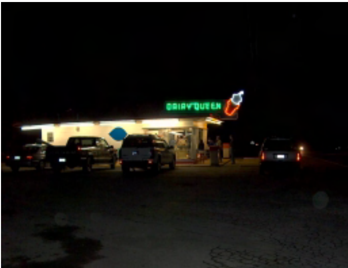
Butler County's roadside architecture has its own charm.

Resources: DCED, local foundations, SPC, banks