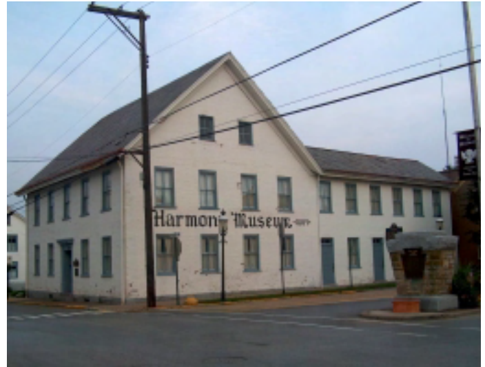
Butler County's Harmony National Historic Landmark District.

Heritage tourism also proved to be a top priority in Butler County due to the recent designation of Historic Harmony as a National Historic Landmark District. Workshop participants stressed the need for coordination among local historical societies and county municipalities to develop heritage tourism in the county. Participants identified the formation of public-private partnerships as a means of furthering heritage tourism initiatives, and suggested that owners of historic sites work with local historical societies to coordinate signage, hours of operation, and volunteer efforts.