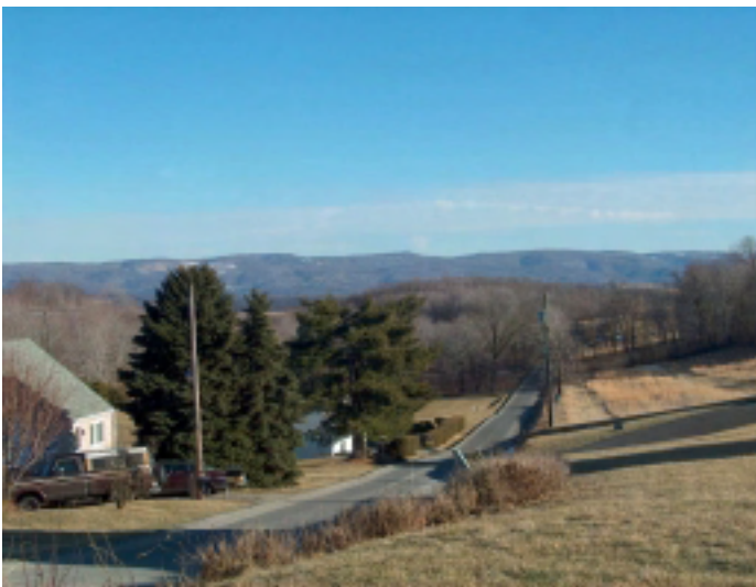
Will Fayette County become the next victim of sprawl?

For decades, Pennsylvanian cities, towns, and suburbs have worked hard to reverse the indicators of a declining region: deindustrialization, population exodus, job losses, and diminished vitality. But recently, efforts to grow the region out of its slump by abandoning older towns and boroughs and developing farmland and greenspace into malls and low-density housing has only exacerbated the decline. The "New Frontiers" project set out to show that historic preservation remains one of the most effective tools for growth and revitalization and should be considered as an alternative to the inconsistent growth pattern known as sprawl.