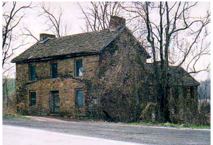
The Peter Colley Tavern (1796) sits along Rt. 40, the National Road.