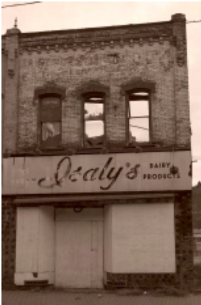
Braddock is gone.

The New Frontiers project is our opportunity as preservationists, environmentalists, decision makers, bankers, investors, homeowners, business owners, employees, and engaged citizens to ensure that we, too, will have a strong region.