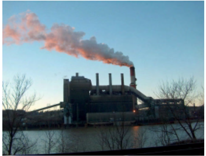
Industry still has a significant presence in Washington County.

Actors: County tourism director, historical society directors, county commissioners, schools and colleges, Pittsburgh Convention and Visitors Bureau, private sector partnerships, PHMC, banks, media ( Observer-Reporter ), and county planners.