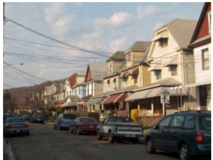
. . .were listed as #2 on YPA's Top Ten Best Preservation Opportunities.