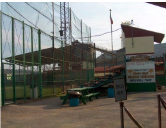
Pullman Park and the West End neighborhood in Butler. . .