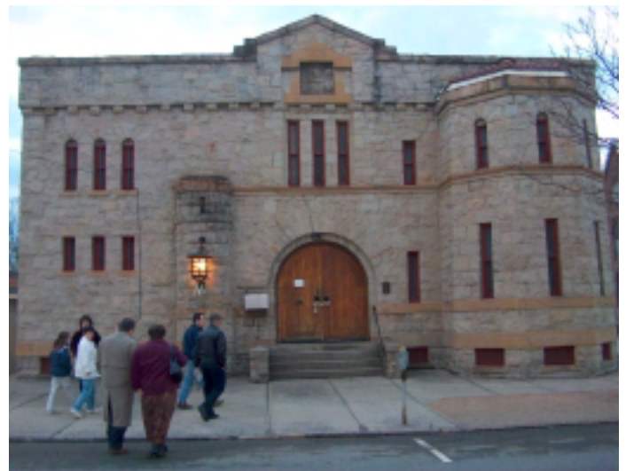
A site tour of the Blairville Armory, winter 2004.

Estimated Cost: Acquisition, $175,000. Feasibility study, $6,000. Adaptations, $82,500.