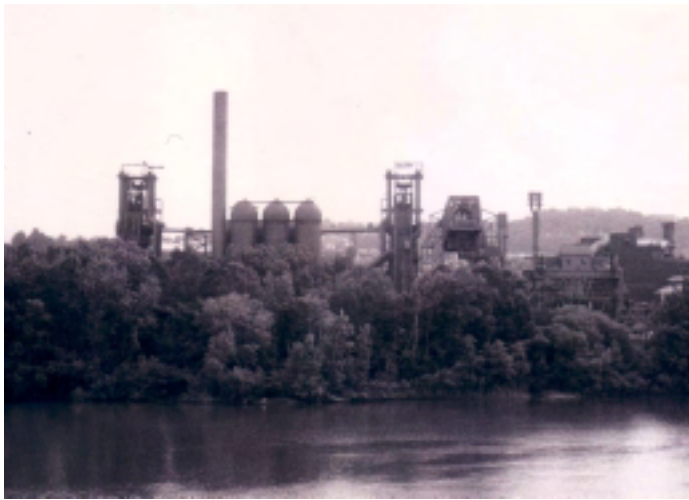
The Carrie Furnaces, as seen from Homestead, 1989.