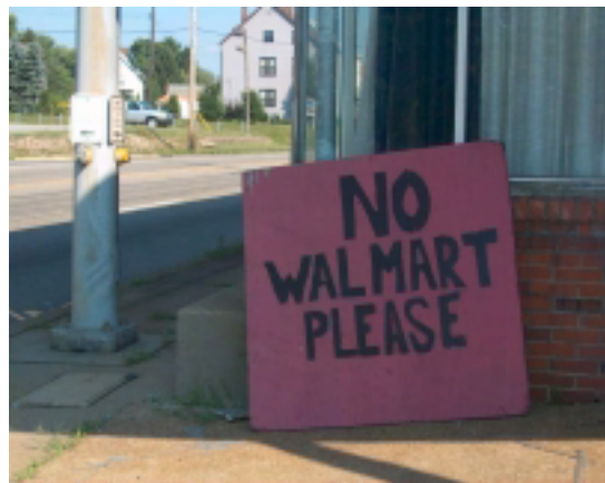
Exercising choice: Route 65 in Emsworth.

Most importantly, the New Frontiers project reveals the need for regional cooperation among historical societies, museums, environmental organizations, and preservationists. It is imperative that all of us in the Pittsburgh area think and act regionally. This means making contact and doing business with other heritage-related organizations within the region and outside of your comfort zone. Butler County needs to communicate with Greene County and Indiana County needs to cooperate with Beaver County. Why? Because we're all in the same boat.