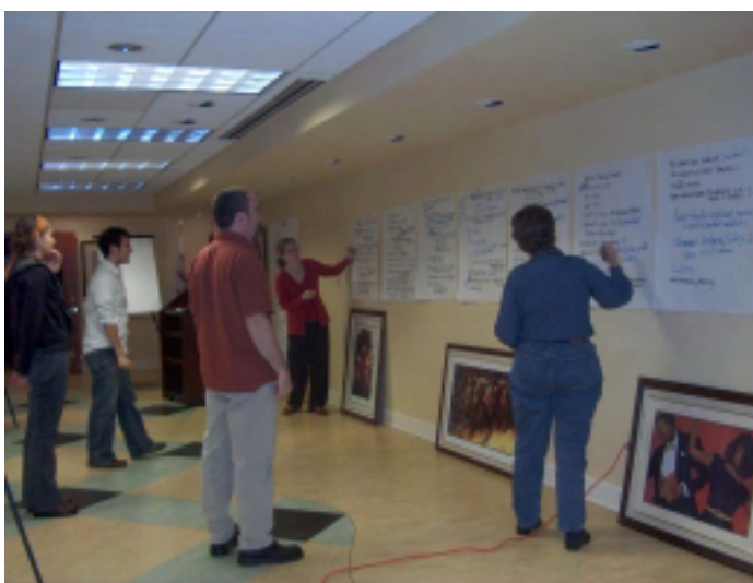
Many priorities to choose from at the Pittsburgh workshop, Sept. 18.