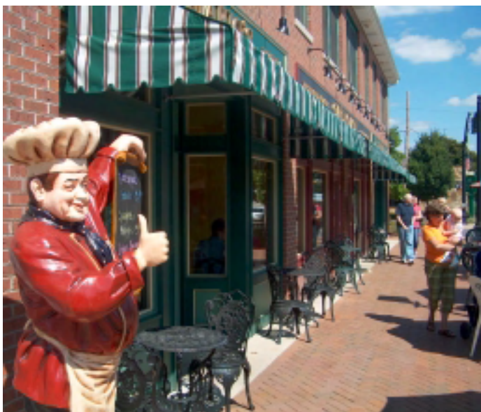
Historic preservation has returned vitality to Beaver's Main Street.