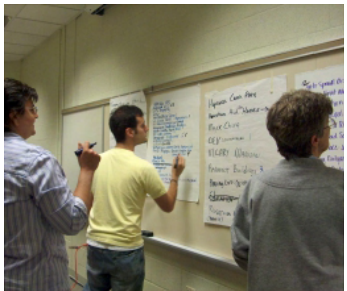
Beaver workshop participants weigh in on preservation priorities.