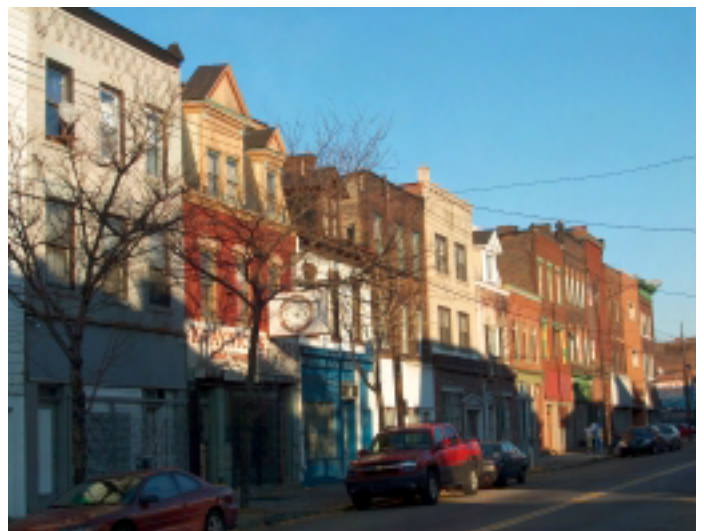
Participants chose Pittsburgh's historic corridors, like Penn Avenue in Garfield, as the top preservation priority.

The workshop participants did not develop action plans for the sites, but many of the sites have action plans of their own. For instance, Main Streets Pittsburgh is supported by the Urban Redevelopment Authority. A plan is actively being pursued for the restoration and reuse of the South Hills High School. And several efforts are currently underway to streamline the vacant property disposition process by the Pittsburgh Partnership for Neighborhood Development, 10,000 Friends of Pennsylvania, and Manchester Citizens Corporation.