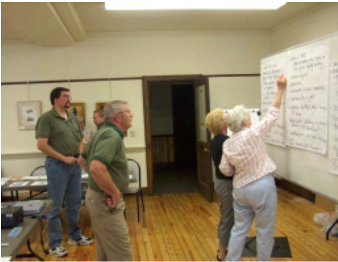
Workshop participants vote for their top preservation priority in Indiana.