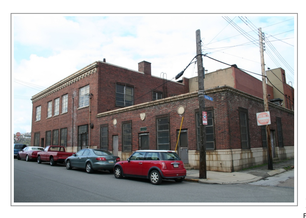
Two views of the rear of the Paramount