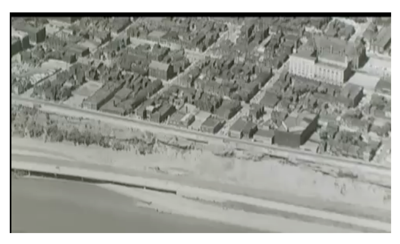
Date: August 18, 1958 Subject: Film Row on the Boulevard of the Allies