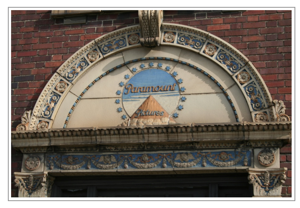
View of the decorative terra cotta design