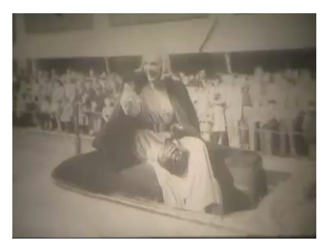
Subject: Film Actress Elizabeth Scott in motorcade, downtown Pittsburgh. 1947