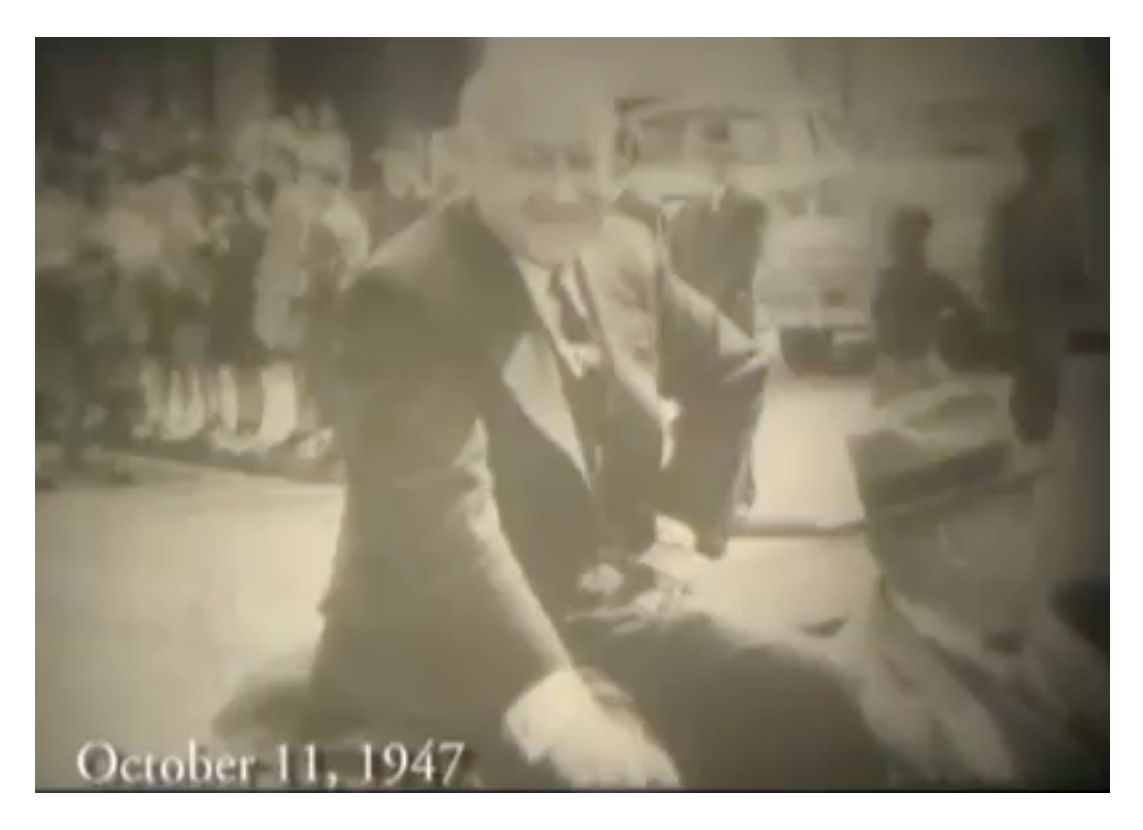
Subject: Cecille B. DeMille rides in motorcade through downtown Pittsburgh for world premiere of Unconquered.

Pittsburgh routinely had Hollywood personalities, celebrity actors and directors visiting for premieres and press opportunities.