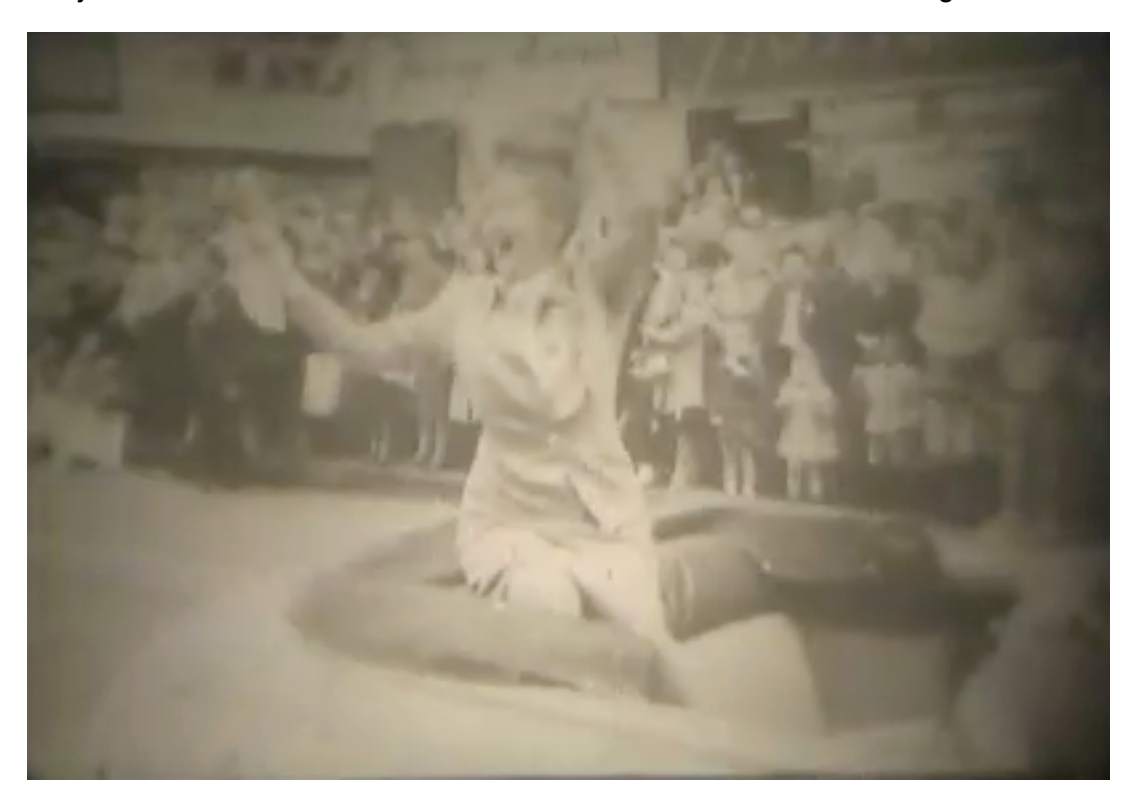
Subject: Celebrity Hedda Hopper in motorcade, downtown Pittsburgh. 1947