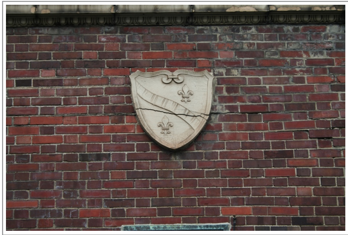
Two views of the