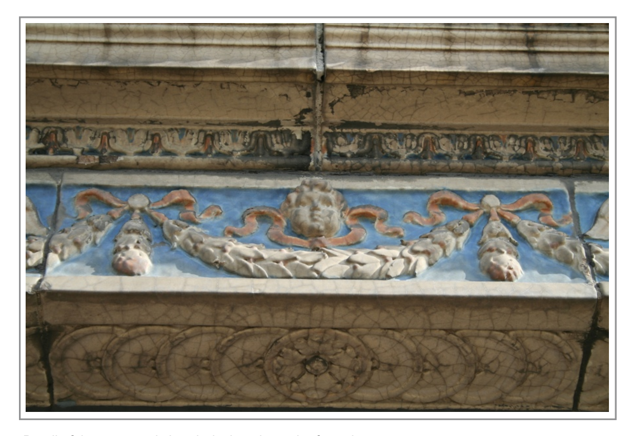
Detail of the swag and cherub design above the front door.