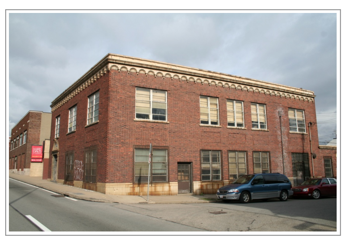
Two views of the Paramount Pictures Film Exchange at 1727 Boulevard of the Allies.

SUBJECT: PARAMOUNT PICTURES FILM EXCHANGE, BLVD. OF THE ALLIES, PITTSBURGH